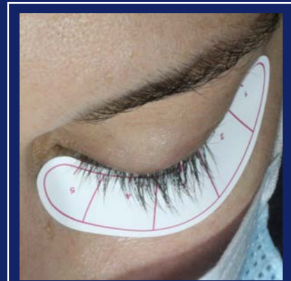
WEEK 16: EGA 4

Photos have not been retouched. Images are reviewed by an expert grader. Results may vary.