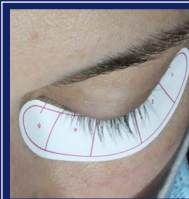
WEEK 8: EGA 3