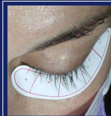
WEEK 12: EGA 4