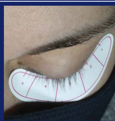
BEFORE: EGA 2

Nu-Cil Results: Lash improvement in as little as 8 weeks with more pronounced results at 16 weeks.*